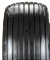
13" Grooved Polyresin Tread