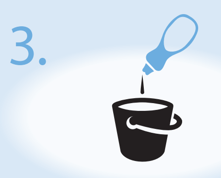
Pour Dura-Bright® Wheel Wash in a bucket. No need to dillute with water.