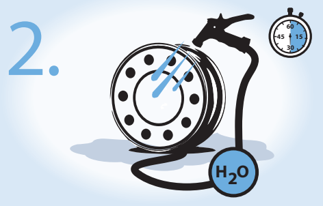
Rinse with water for at least 30 seconds.