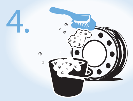
Clean the wheel.